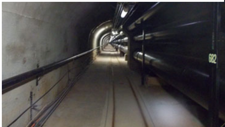
Red Hill Lower Access Tunnel with fuel pipelines | Click image to enlarge